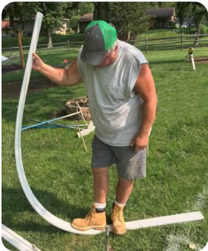
Can be bent to a 3 foot radius.