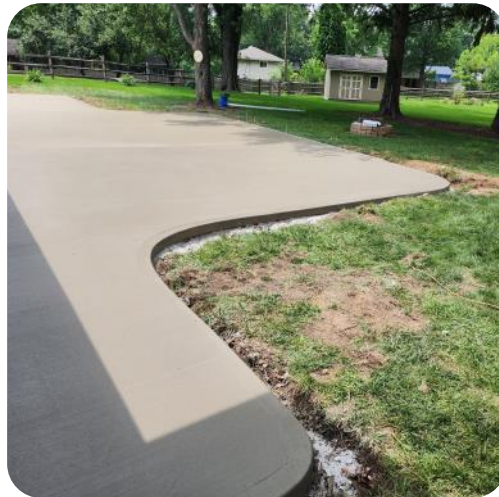
Perfect for curved patios and walkways.