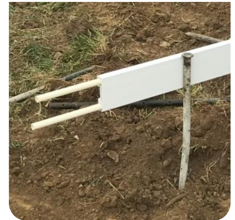
Can be connected with standard 1/2" SDR-11 pipe.