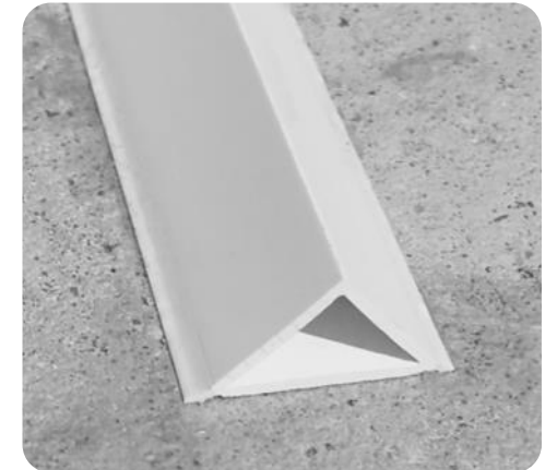
#885 V-Groove glued to slab