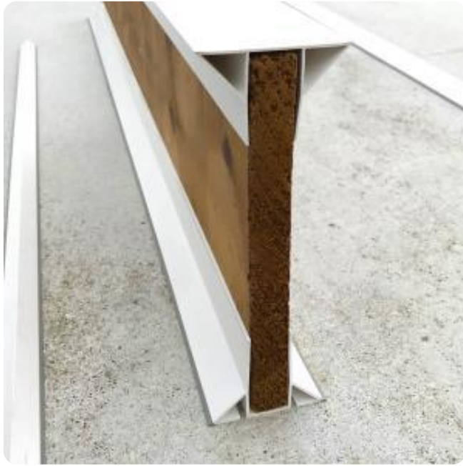
#725 One-Piece Bulkhead with #803 Topside Double Chamfer 1x3/4"