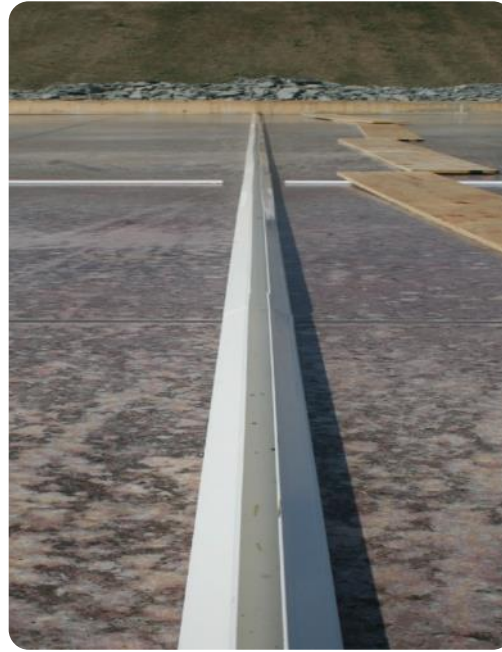
#767 Standard Series Bulkhead attached with #876 Base Clip