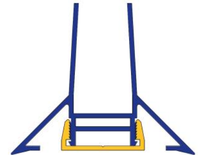
#767 Standard Series Bulkhead with #876 Base Clip