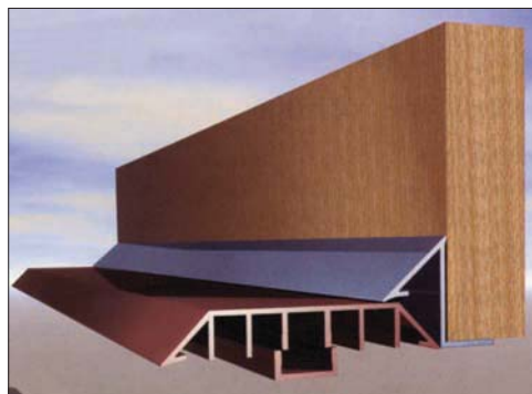
Recessed Window System

Fukuvi USA, Inc. Victory Bear Products 7631 Progress Court CenterPoint 70 Commerce Park Huber Heights, OH 45424